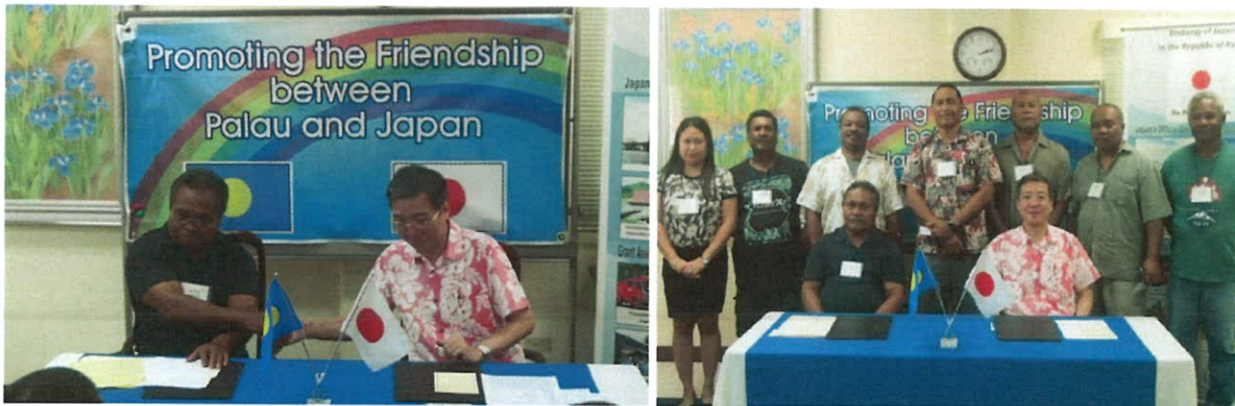
Signing of the grant contract on December 6, 2018

The Embassy of Japan in the Republic of Palau awarded the sum of $88,950 for the procurement of a Dump Truck and a Motor Grader pursuant to a Grant Contract executed between the Embassy of Japan and Ngchesar State Government on December 6, 2018, as shown below in a signing ceremony: